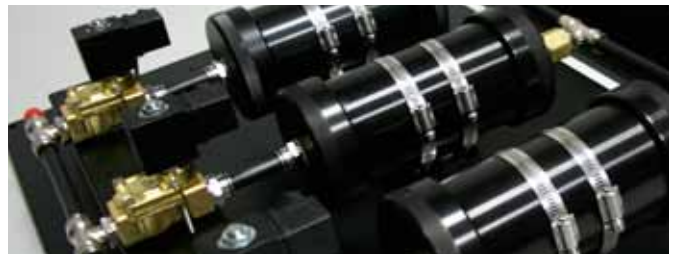
SmX-4DS Chamber Module